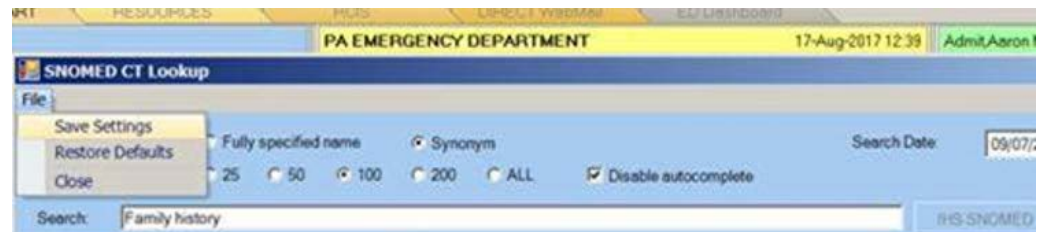
Saving Personal Settings on SNOMED CT Search Dialog